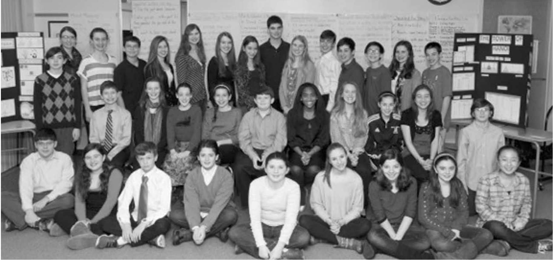
Pictured are NS Middle School students who will participate in the Long Island Math Fair this March.