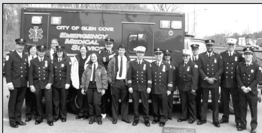
Glen Cove EMS has a fresh new look. The Glen Cove St. Patrick's Day Parade was our first event wearing new formal uniforms. EMS was established in 1985 and since then never had full uniforms to wear at formal events. These new uniforms were purchased for our department through 2012 City of Glen Cove capital funding.