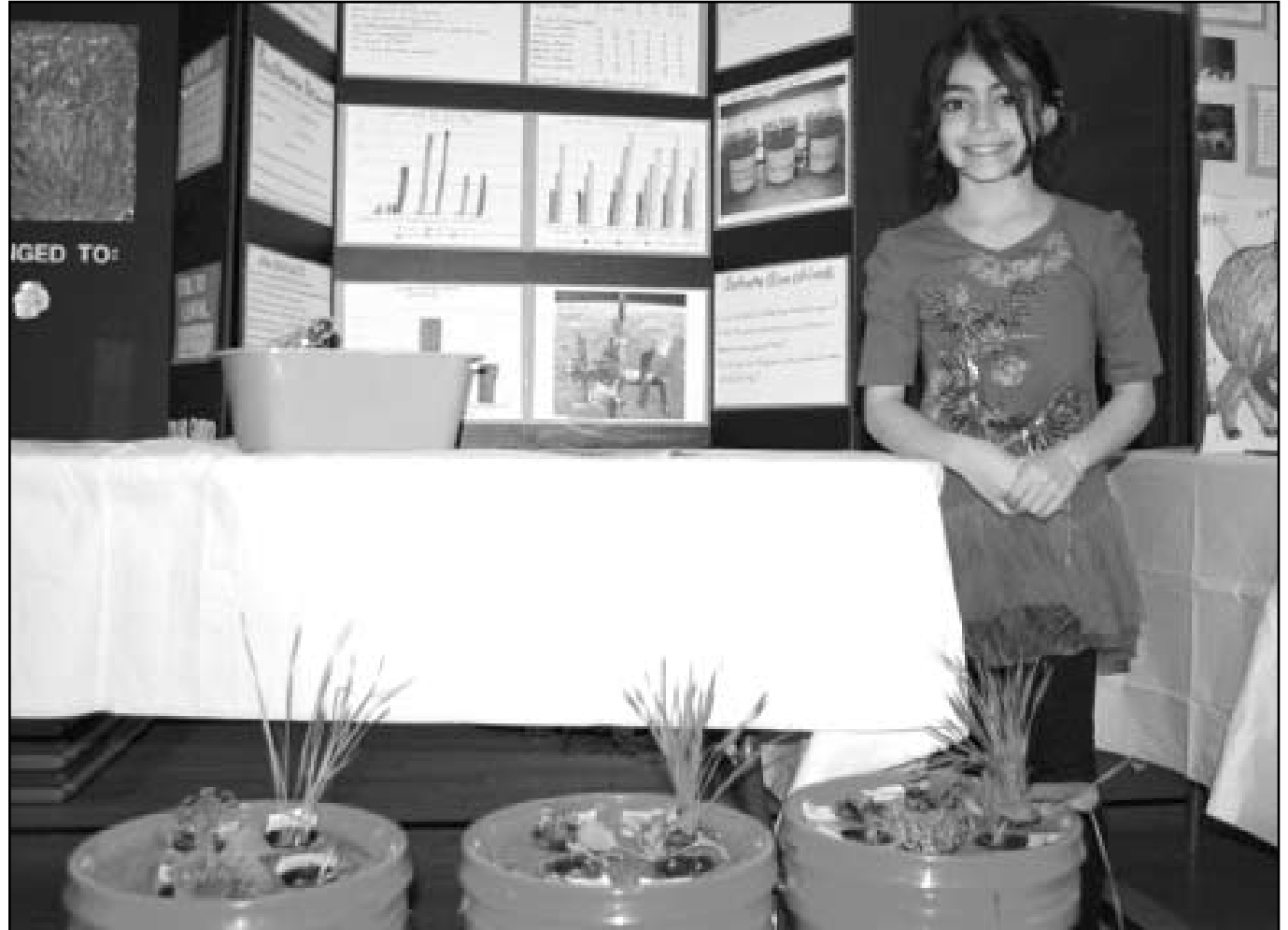
At Glenwood Landing students from all grade levels received an overview of the scientific method to complete independent projects at the Science Fair.