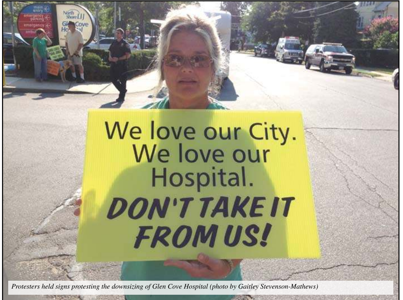
Protesters held signs protesting the downsizing of Glen Cove Hospital