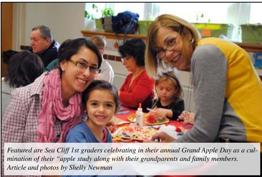
Featured are Sea Cliff 1st graders celebrating in their annual Grand Apple Day as a culmination of their "apple study" along with their grandparents and family members.