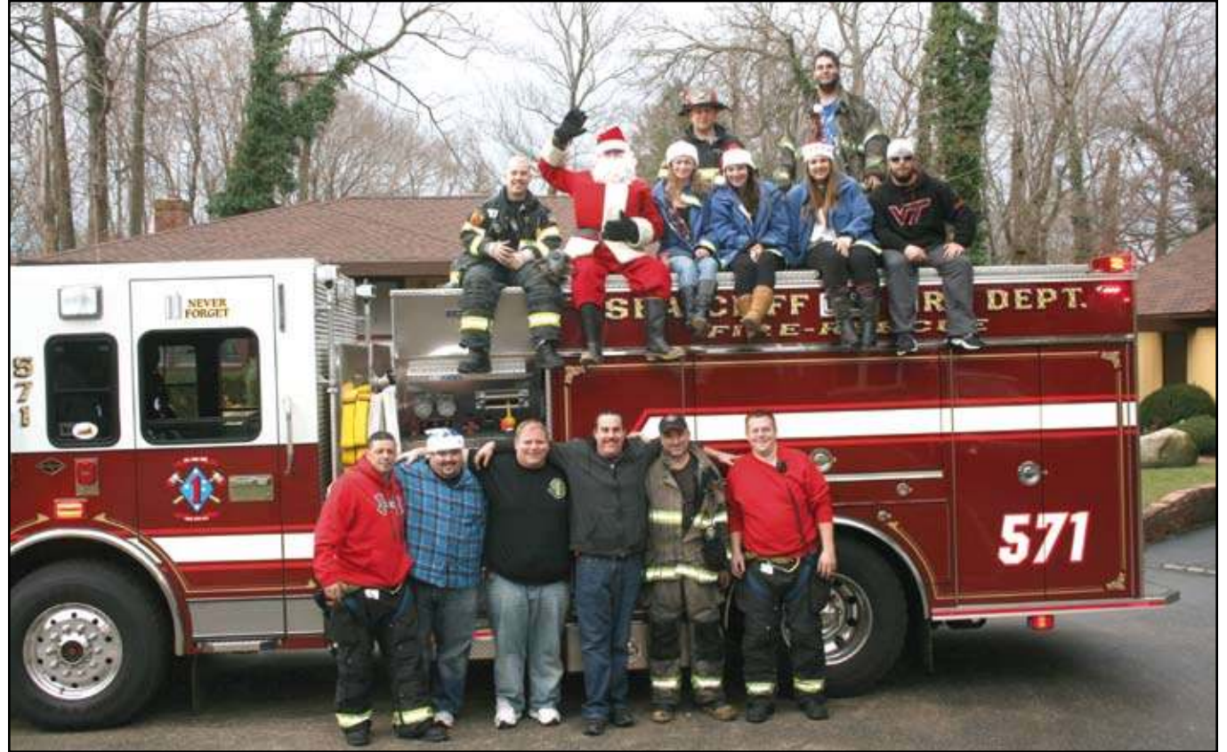
Firemen do the Santa run through the Village on December 22.