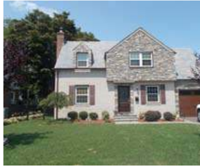
SOLD 1 FAMILY