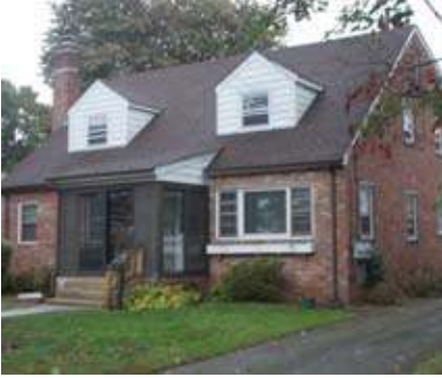
SOLD 2 FAMILY

77 Cedar Samp Road, Glen Cove 516-676-8208 Serving Your Realstate Needs Since 1978