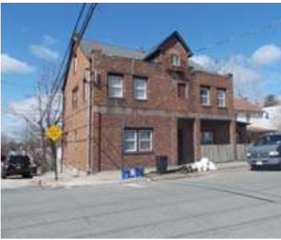
UNDER CONTRACT 4 FAMILY