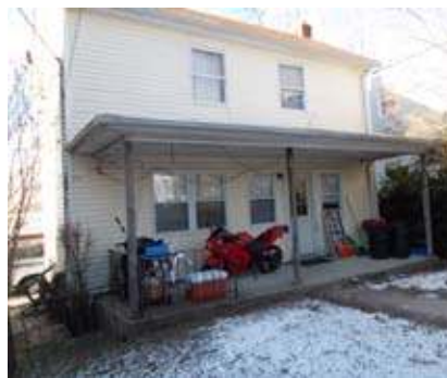
UNDER CONTRACT 1 FAMILY

As always we will continue serving you; buying, selling, or renting, we make it happen. List with us for fast professional service.