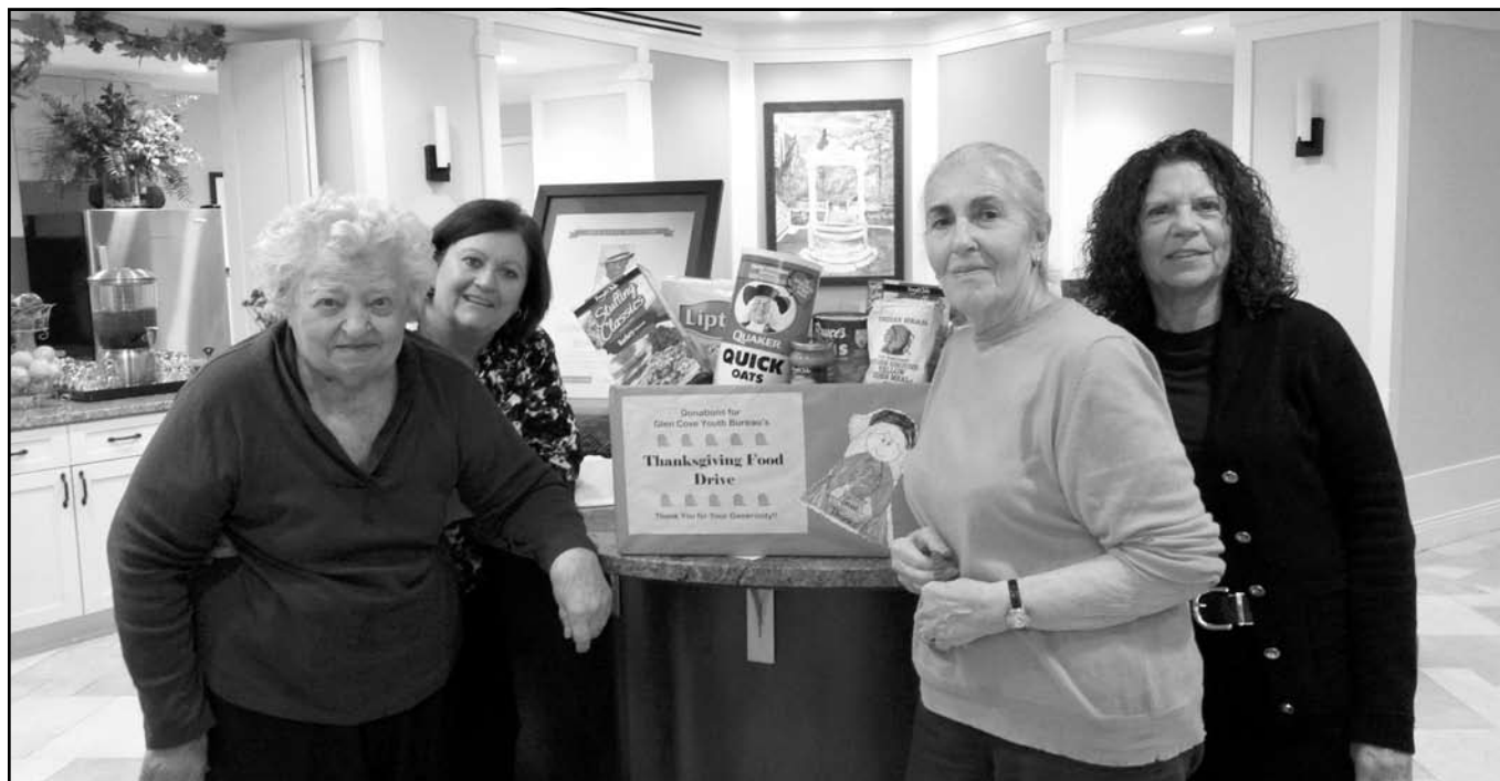
Each year, residents and staff at The Atria generously donate to the fall food drive. This year's donations helped the Friends of the Glen Cove Youth Board and the Glen Cove Youth Bureau provide nutritional assistance to over 1,300 people from 322 families during November and December.

Thanks to the generosity of many, the holidays were truly a time to give thanks, both for a delicious meal and for the people and groups that made it possible.