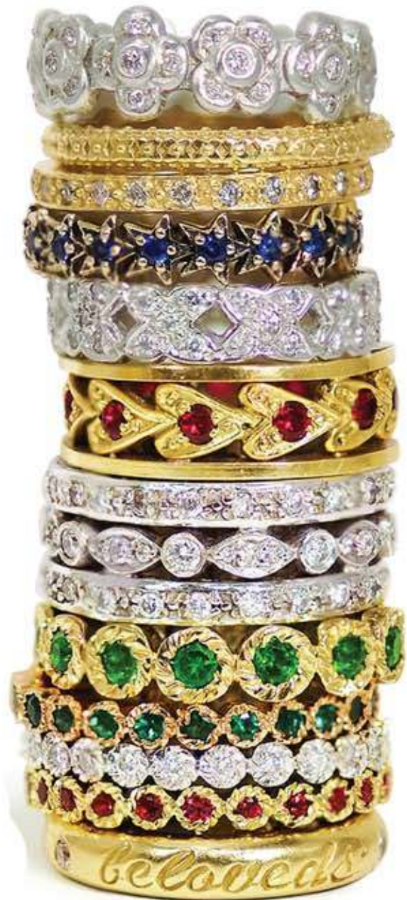
©2014 Glenn Bradford Fine Jewelry Corp. & Glenn Bradford Licensing Group, Inc.