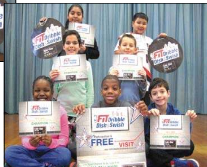
(right) Landing School's seven NBA FIT Dribble, Dish & Swish regional finals competitors.