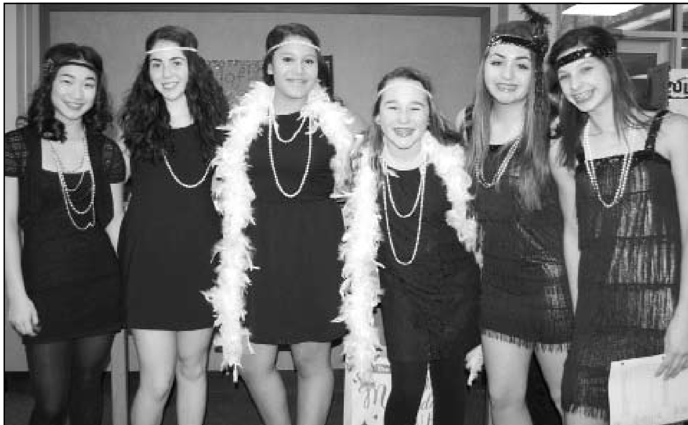
Pictured are eighth graders at North Shore Middle School who transformed their library into a Roaring 20's speakeasy with posters and various decorations and dressed, acted, and spoke like their 1920s counterparts to enthusiastically study this exciting time period in history.

To conclude, the students also participated in a Charleston dance contest! Many thanks to the faculty, staff, and students who participated in this historic, hands-on learning opportunity. It was evident that a "roaring" time was had by all!