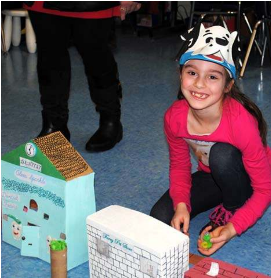
Elementary students at Glen Head School participated in a "Community Celebration" where each child became a member of their community including a fireman, policeman, school teacher, doctor, and postal worker just to name a few!