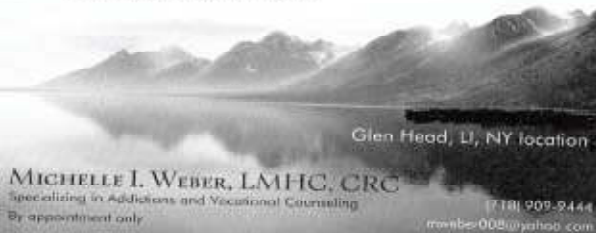
Glen Head, LI, NY location