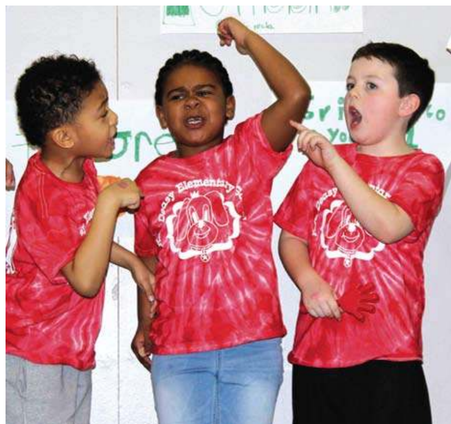
Students from Deasy School excitedly cheered their team on at the games.