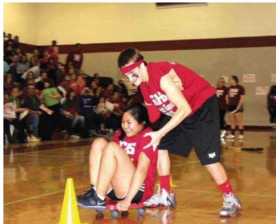
Members of the red team battled to the finish during the relay event.

The green team was victorious, winning two of three activities at the event. After the winner was announced, high school seniors from both teams challenged district faculty members in a volleyball game. The faculty members came out on top, winning the game!