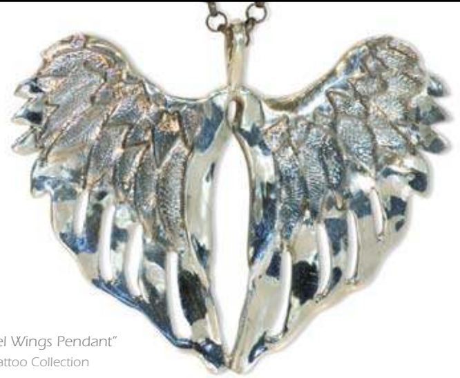
"Angel Wings Pendant" Tattoo Collection