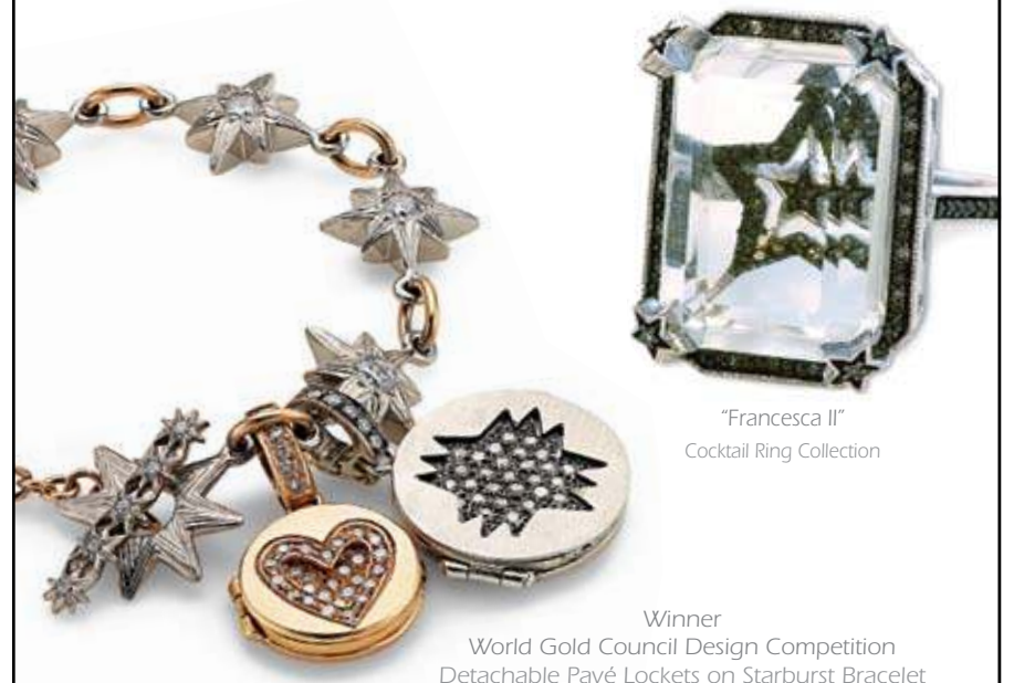
"Francesca II" Cocktail Ring Collection

AWARD-WINNING JEWELRY DESIGNER ~ PHILANTHROPIST SELECTED ONE OF AMERICA'S COOLEST JEWELRY STORES