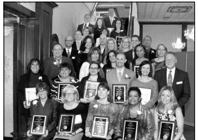
Recipients of this year's SCOPE Teacher Service Award.