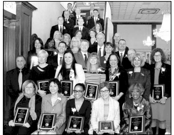
This year's recipients of the SCOPE Administrator Service Award.