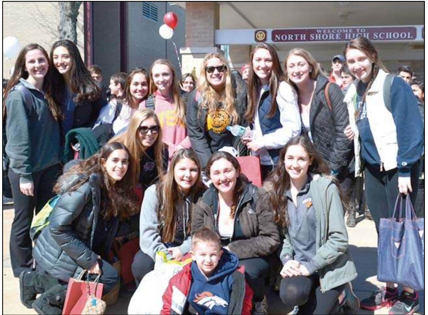
Photo Caption: Photo Caption: Pictured is the North Shore Women's Basketball Team, after beating Harborfields to become the Long Island Champions, the Vikings captured the Long Island Class A girls basketball title for the first-time ever!