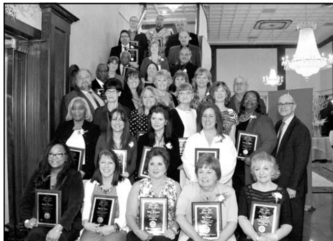
This year's proud recipients of the SCOPE Support Staff Service Award.