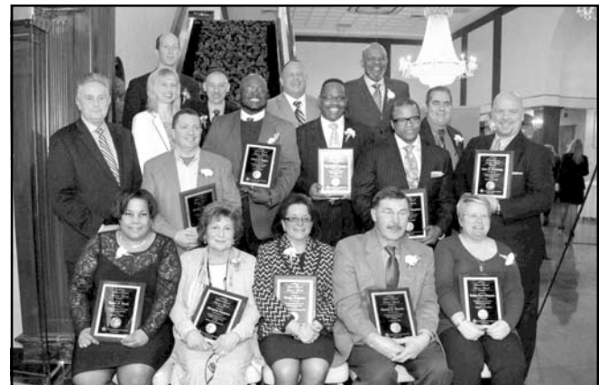
Recipients of the SCOPE School Board Service Award proudly display their plaques.