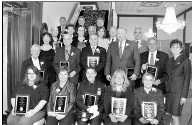
Recipients of this year's SCOPE Community Service Award.