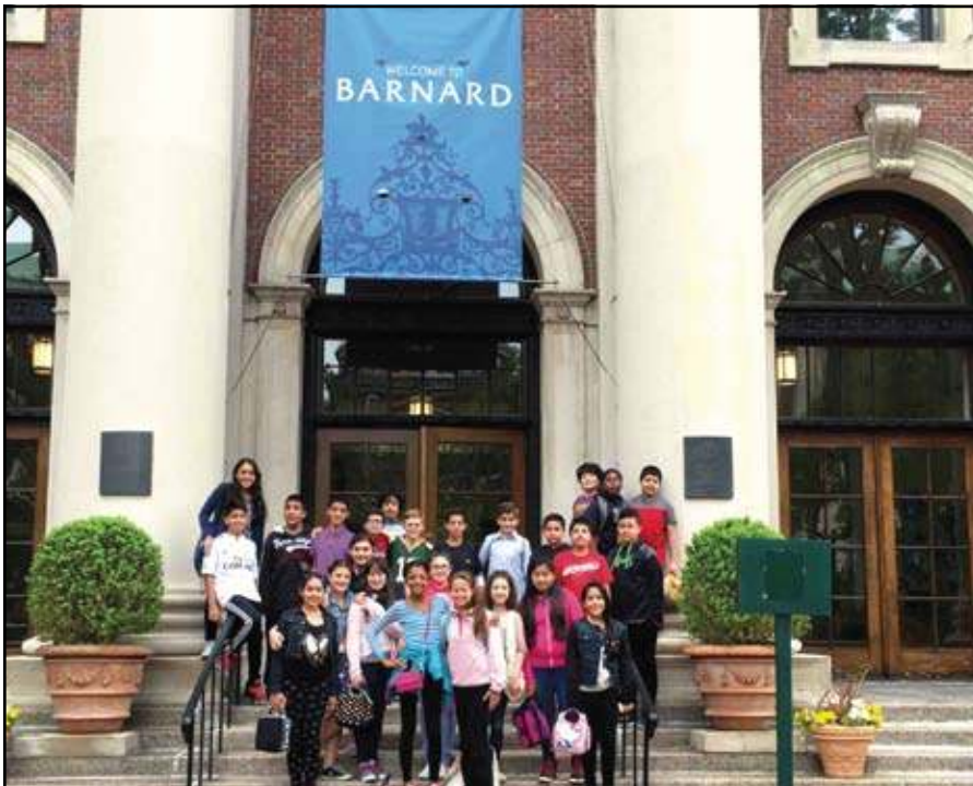
Photo Caption: Finley Middle School students visit Barnard College Campus in New York City.

They were given a campus tour and learned about Barnard's commitment to providing a competitive education that propels opportunities for women. Students saw firsthand why Yousafzai continues to selflessly fight for girls' education.