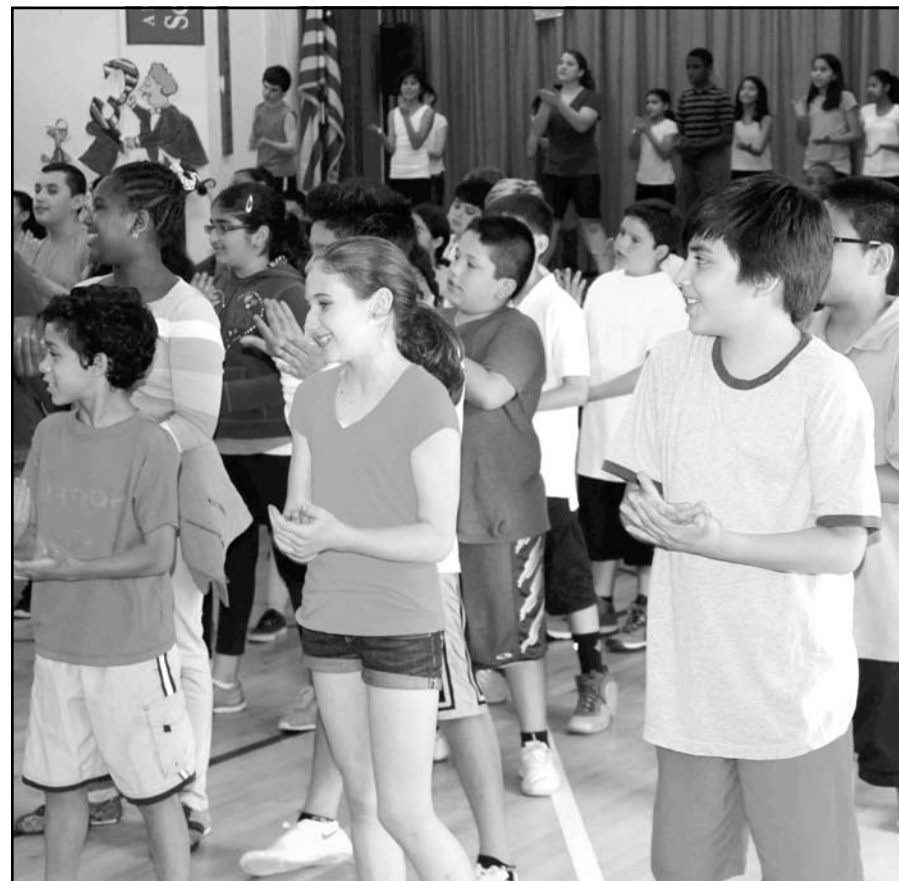
Landing students smiled broadly as they performed in the school's Ballet.