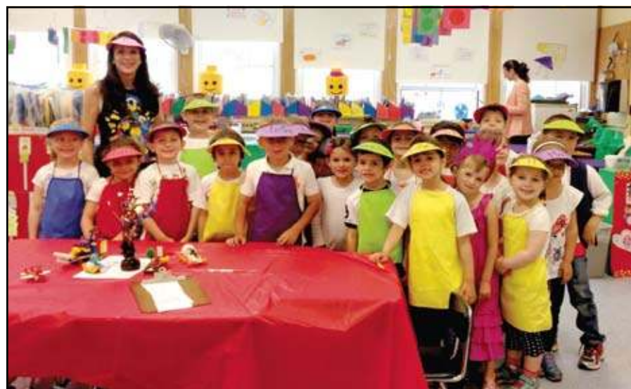
Photo Caption: Cafes were up and running at Glen Head School as kindergarteners dressed up and served their family and friends delicious breads at the "Kindergarten Café" event. Article and photos by Shelly Newman

The students in each café took on the following jobs: bus boys and girls, waiters and waitresses, hosts and hostesses, kitchen workers, samplers, recipe book salespeople, cashiers, money changers and managers. The kindergarteners took their jobs very seriously and worked as a team to serve and please all those in attendance to the delight of all those who gathered to enjoy a delicious breakfast treat!