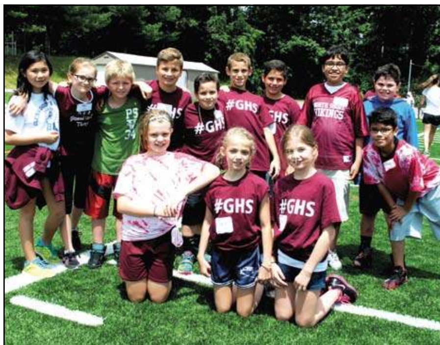
Photo Caption: A "fun day" to meet other fifth graders from all three North Shore elementary school who will be headed to NS Middle School in the fall! Article and photos by Shelly Newman

activities tested running and jumping skills, hand-eye coordination, dexterity and balancing proficiency. Three cheers to all the fifth graders and their physical education teachers who participated in this awesome fun day!