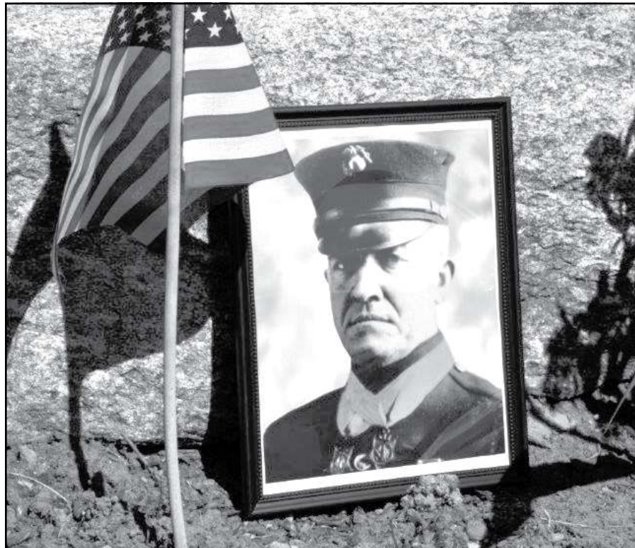
A framed photograph of Dan Daly is placed at the base of the Dan Daly Memorial Monument

Sergeant Major Daniel “Dan” Daly was a U.S. Marine who earned two Medals of Honor, the Navy Cross, the Army Distinguished Service Cross, the Purple Heart and the Croix de Guerre from France. Daly was born on November 11, 1873 in Glen Cove, retired from the U.S. Marine Corps in 1929 and died in 1937.