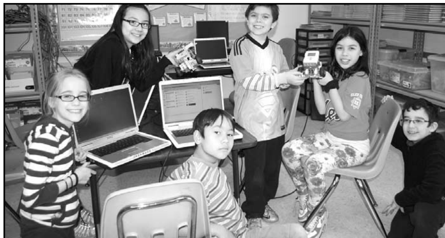
Pictured are Sea Cliff students showcasing their science, technology, engineering and math knowledge in the 2014 S.T.E.M. Fair. In a symposium format, students displayed and presented their projects for the entire school to see!