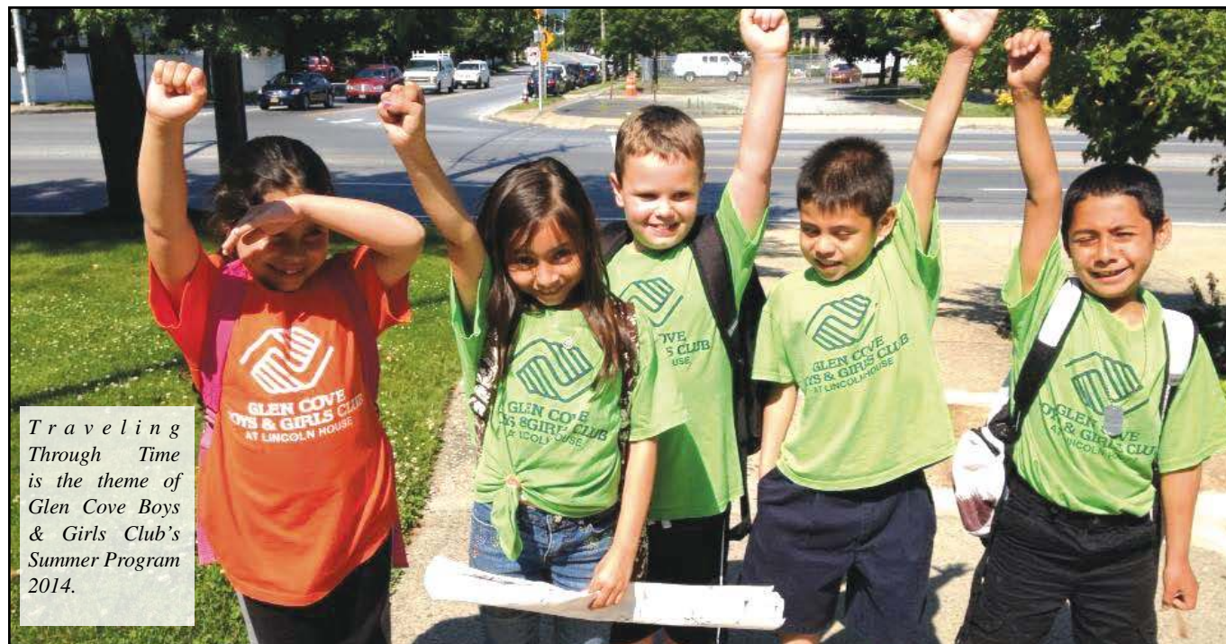
Traveling Through Time is the theme of Glen Cove Boys & Girls Club's Summer Program 2014.

For more information on Glen Cove Boys & Girls Club and Club programs, visit www.glencovebgc.org .