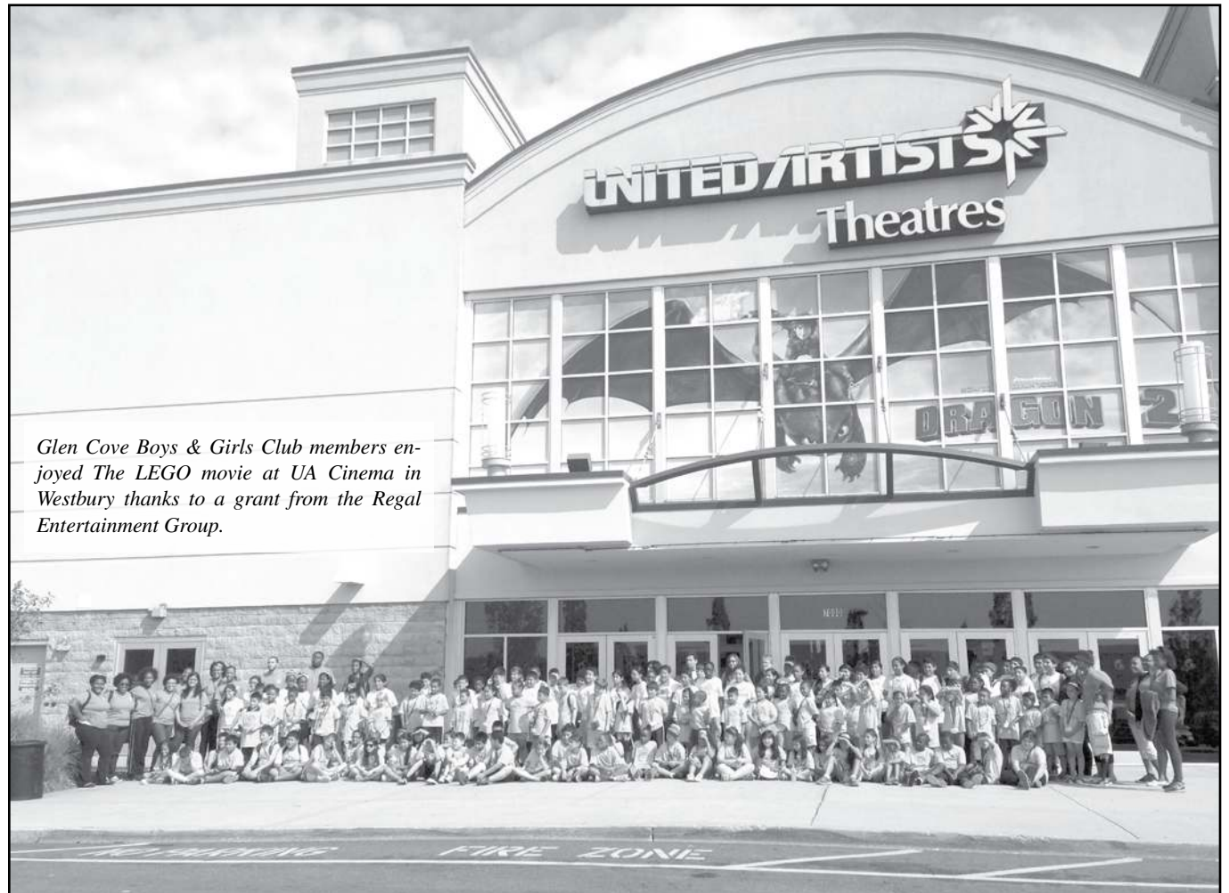
Glen Cove Boys & Girls Club members enjoyed The LEGO movie at UA Cinema in Westbury thanks to a grant from the Regal Entertainment Group.