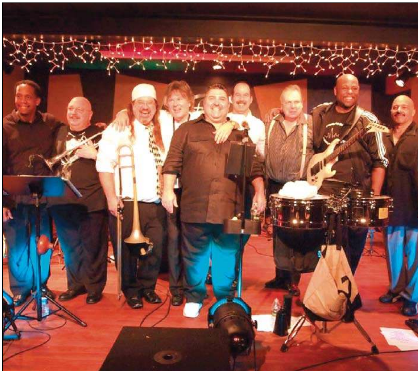
The Sounds of Society perform a tribute to the band Chicago on Sunday, August 3 as part of the 2014 Morgan Park Summer Music Festival. The show, which is free to the public, will begin at 7:30 p.m. in Morgan Park. Come and enjoy a wonderful evening of musical entertainment that is sure to delight the whole family.

Morgan Park Summer Music Festival is an all-volunteer nonprofit organization that has been providing free concerts in the park for 55 years. The shows are completely funded through the generous donations that are received from businesses and individuals. Taxpayer money is not requested nor received to bring this high caliber talent to the Festival.