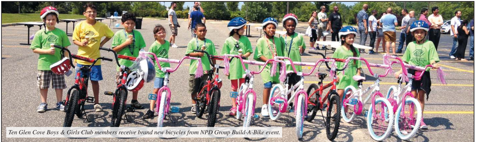
Ten Glen Cove Boys & Girls Club members receive brand new bicycles from NPD Group Build-A-Bike event.

Ten Glen Cove Boys & Girls Club members between the ages of seven and nine received newly assembled bicycles thanks to a Build-A-Bike event organized by the Activities Committee at The NPD Group, a global market information company based in Port Washington.