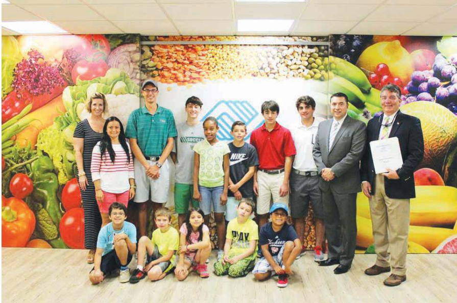
Glen Cove residents driving force behind Glen Cove Boys & Girls Club First Tee® DRIVE.