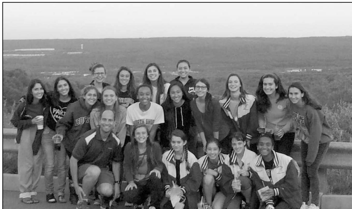
Photo Caption: Pictured is the North Shore Women's Cross Country Team in Scranton, PA, overlooking the gorgeous countryside.

Entering the season, the team had a winning streak of 76-0 in league competition and won six consecutive county championships.