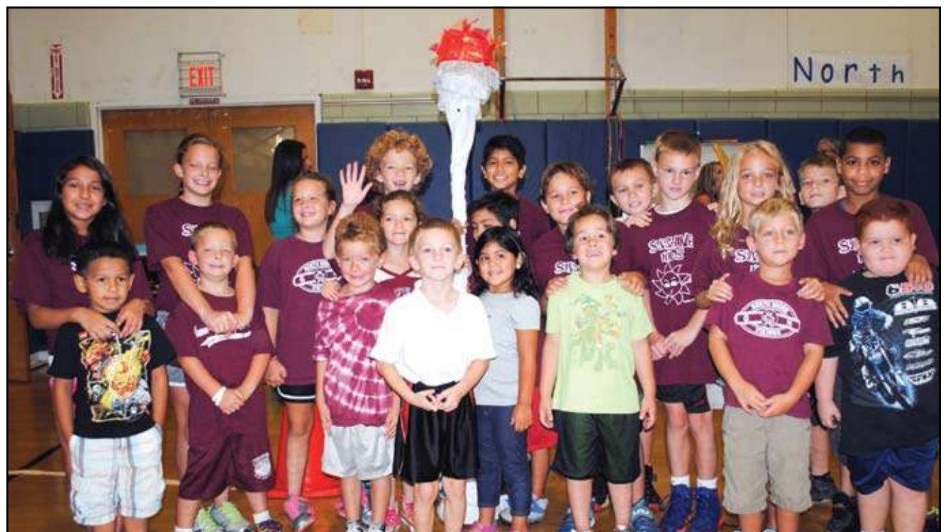
Pictured are a new generation of Glen Head students with their siblings participating in the annual Torch Lighting Cer-