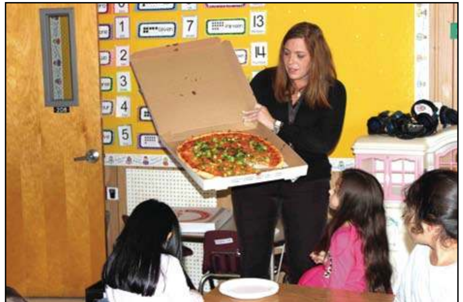
A teacher showed off the Harvest Salad Pizza to her students.