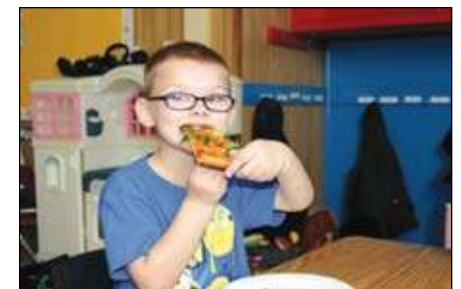
This Deasy student said the pizza was delicious.