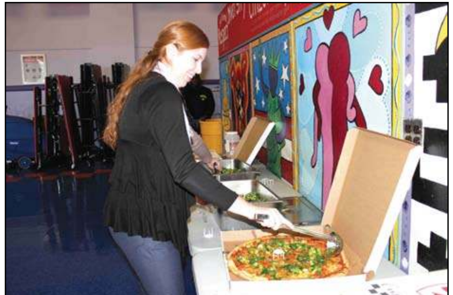
Teaching assistants at Deasy School top pizza with vegetables and herbs grown in the school's organic garden.

Vegetables from the organic garden are also used to supplement the cafeteria salad bar at Deasy. Students will have additional opportunities to eat what they have grown throughout the school year.