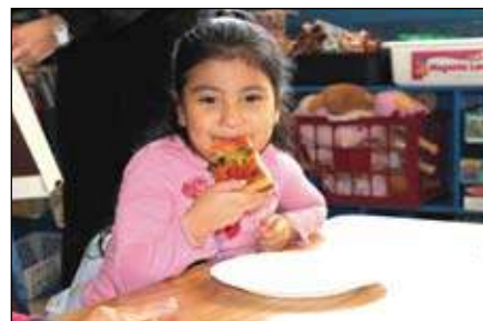
A Deasy student enjoyed her Harvest Salad Pizza.