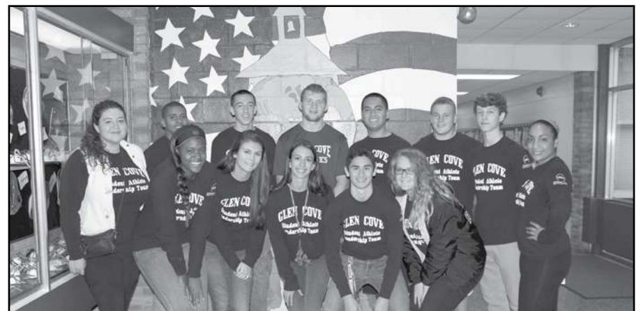
Members of Glen Cove High School's S.A.L.T. program visited students at Gribbin School.