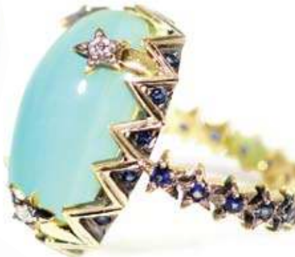
"The Moon & Stars" 18kt. Green Gold Cocktail Ring with Peruvian Opal, Pavé Diamonds & Sapphires.