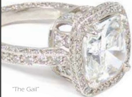
"The Gail" Custom Platinum and Diamond Engagement Ring.

Design with a deeper meaning. In the spirit of gifting and giving back "Shop for Charity" November 15th through Christmas.