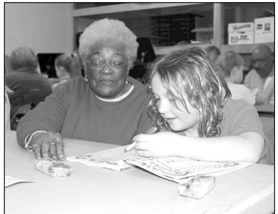
A student from Landing School received help with a word search from a member of Glen Cove's Senior Center.