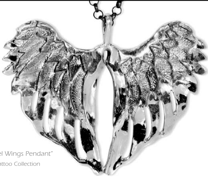
"Angel Wings Pendant" Tattoo Collection