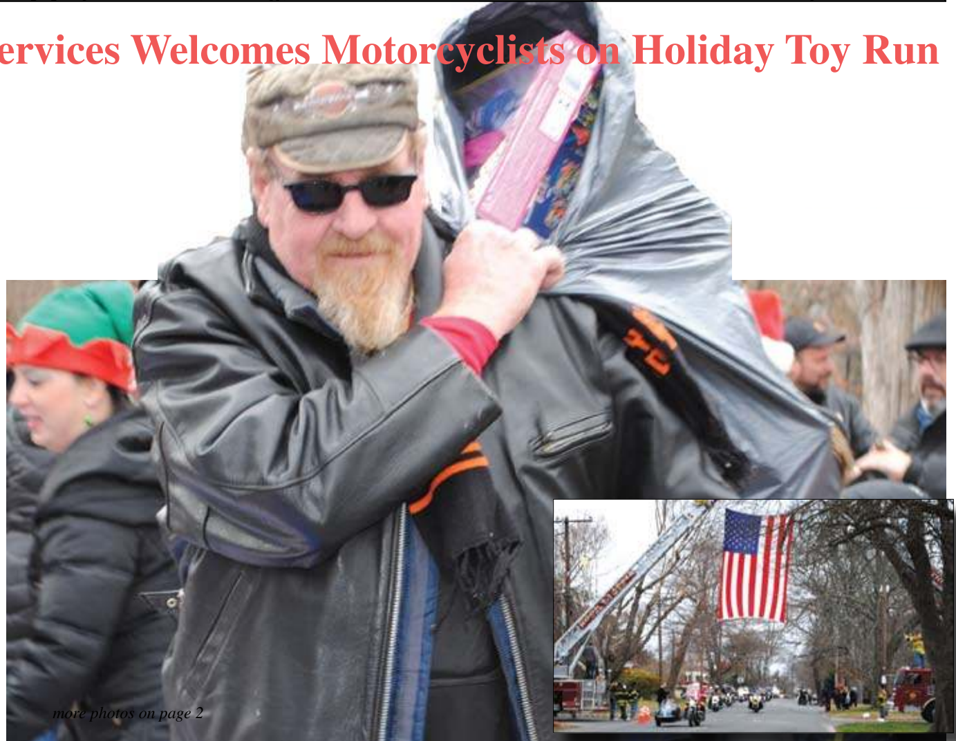
more photos on page 2

SCO Family of Services helps vulnerable New Yorkers build a strong foundation for the future. We get young children off to a good start, launch youth into adulthood, stabilize and strengthen families and unlock potential for children and adults with special needs. SCO serves 60,000 New Yorkers each year in New York City and on Long Island.