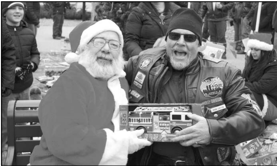
Santa put smiles on not only the children of SCO but those who motored too.