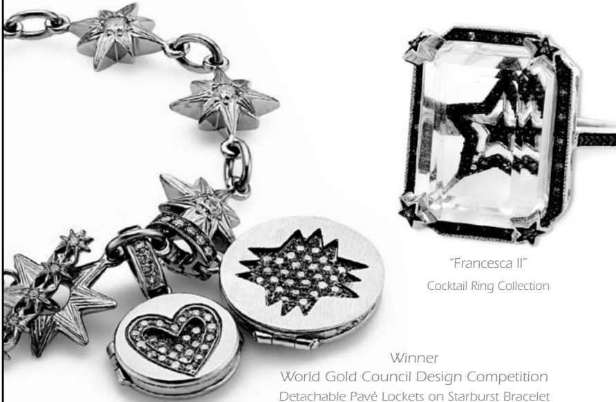
"Francesca II" Cocktail Ring Collection

Design with a deeper meaning. In the spirit of gifting and giving back "Shop for Charity" Now through Christmas.