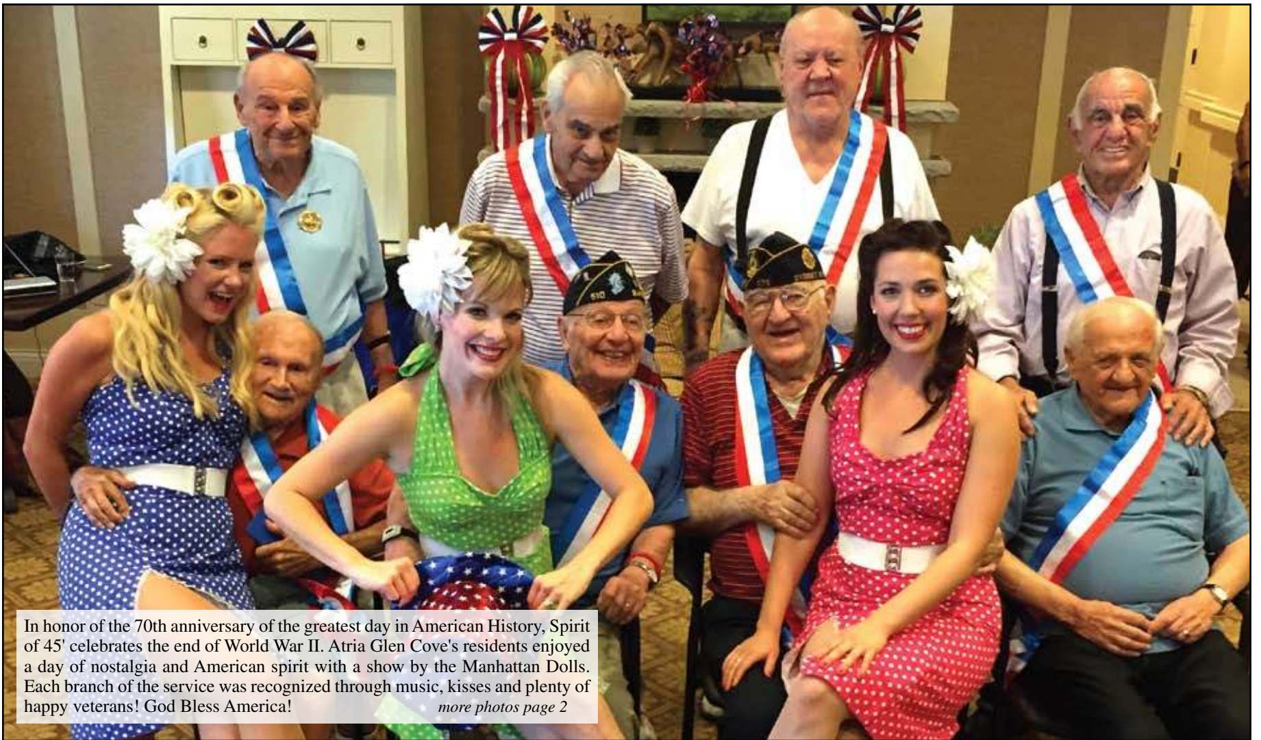
In honor of the 70th anniversary of the greatest day in American History, Spirit of 45' celebrates the end of World War II. Atria Glen Cove's residents enjoyed a day of nostalgia and American spirit with a show by the Manhattan Dolls. Each branch of the service was recognized through music, kisses and plenty of happy veterans! God Bless America! more photos page 2