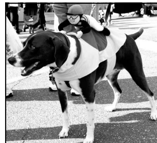
One of last year's Howl'oween Parade contest entrants was off to the races.

office will be on-hand to register dogs for a New York State Dog License. Refreshments and snacks will be available for sale for human participants while PETCO is providing free treats for the dogs. The Howl'oween Pet Parade is sponsored by Glen Cove Parks & Recreation, PETCO and Scoopy Doo. The rain date is Sunday, November 1, 2015. For more information, please contact Parks & Recreation at (516) 676-3766.