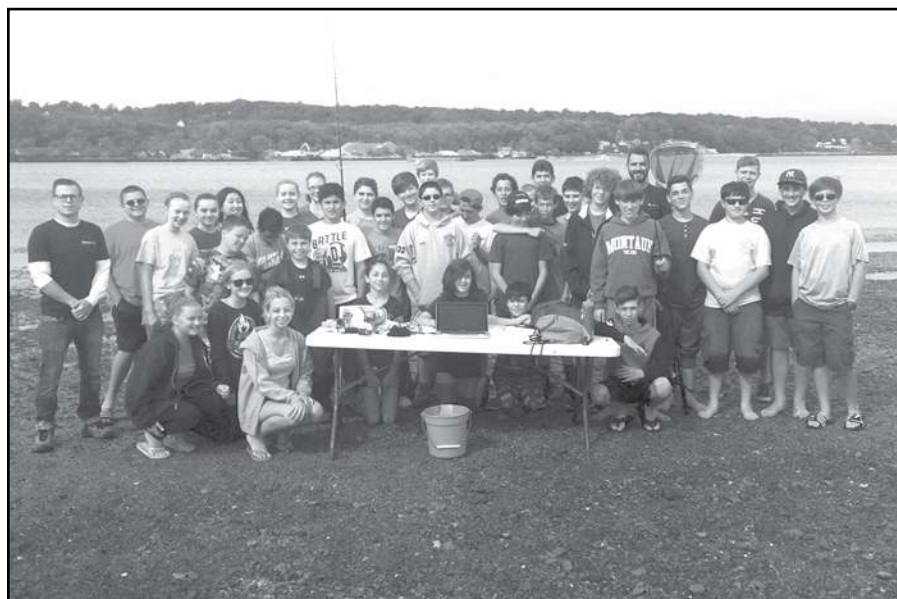
Photo Caption: Pictured are North Shore Viking Explorers at Tappen Beach working in teams, rotating through four different activity stations including piloting the underwater Remotely Operated Vehicle(ROV) while troubleshooting robotic interface issues

They researched the formation of beaches like Tappan and its local inhabitants in order to predict which species would be in our environment, and digitally documented the teams' progress. Stay tuned for exciting more adventures and expeditions of the Viking Explorers!