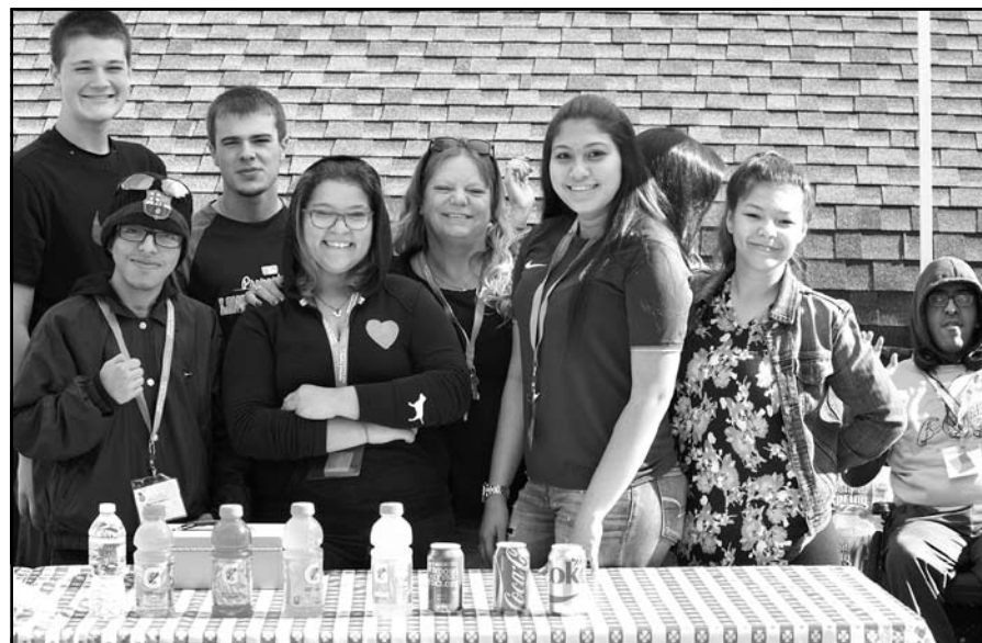
Students at Mill Neck Manor School for the Deaf run the soda booth at each Fall Harvest Festival.