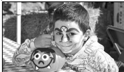
Artistic combo: Kids' creative pumpkins and delightful face painting by Agostino Arts.