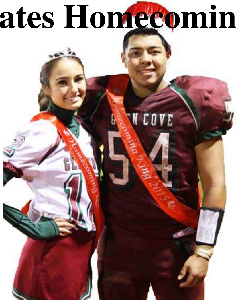
Additional photos on page 15

Unfortunately, Glen Cove couldn't hold on to their first-half lead and were ultimately defeated by Bethpage, 43-37.