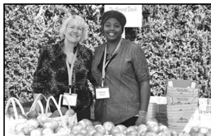
Loyal volunteers are the lifeblood of the Mill Neck Family's yearly "Apple Fest."

Neck Family expresses sincere gratitude to all who make it possible, time after time. This event would simply not happen without our loyal volunteers, students, staff, Mill Neck Manor alumni, vendors, donors, friends, parents and our generous supporters. Our 2015 supporters include: Summit Advisors