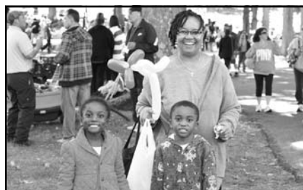
During festival weekend, Mill Neck Manor's beautiful campus once again welcomed many families.