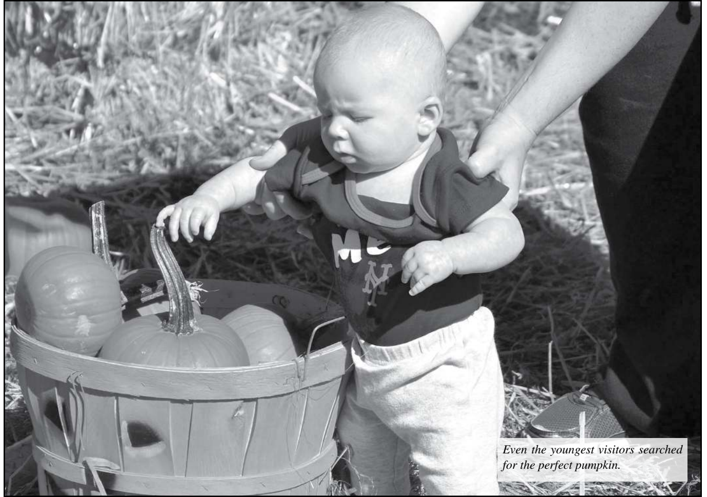
Even the youngest visitors searched for the perfect pumpkin.