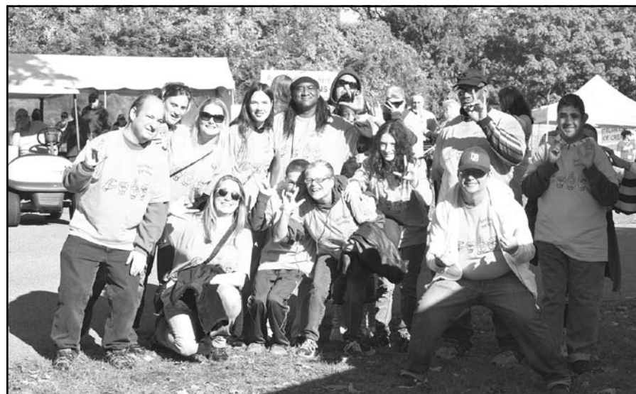
A group from Mill Neck Services Day Hab program enjoyed the festival all weekend.