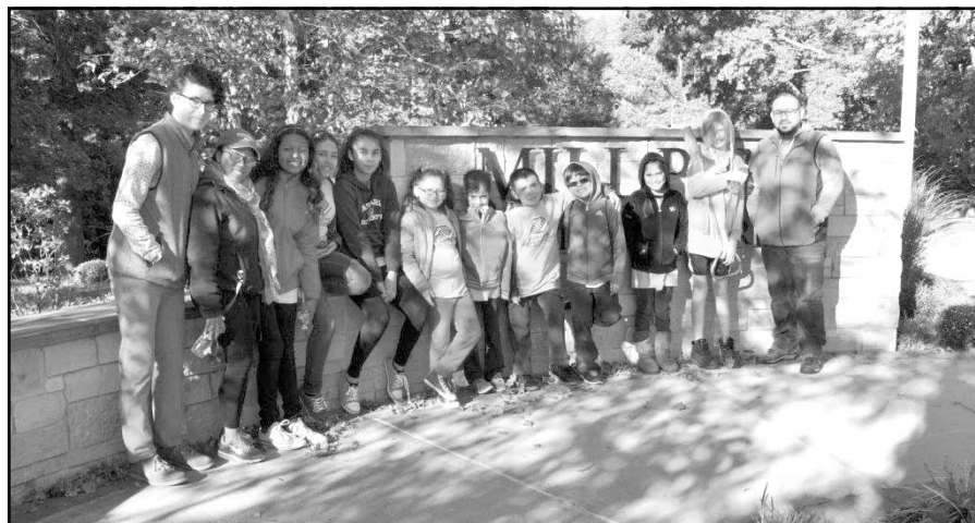
Children from the Glen Cove Boys & Girls Club lend a green thumb with Glen Cove's fall clean-up and planting day.