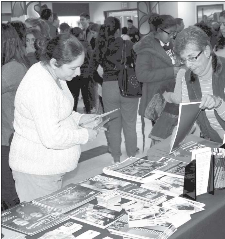
Those in attendance had an opportunity to receive information on various local community agencies.