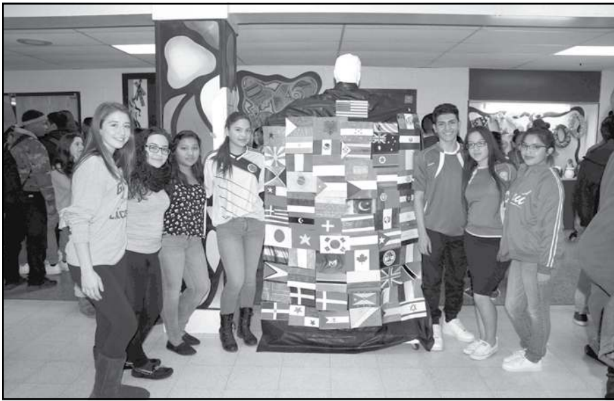
AP Spanish students created a cape made up of colorful flags from different nations and other decorations for International Night.

Foreign Language and ESL Coordinator Monica Chavez organized International Night as a way to reach out to Glen Cove families who speak English as their second language.