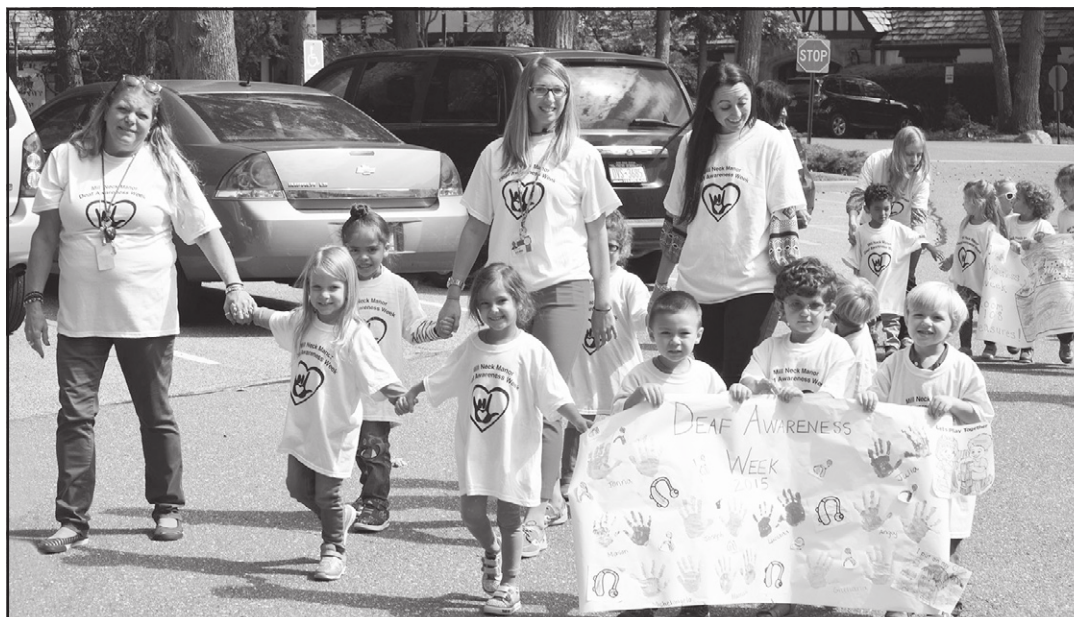
Mill Neck Manor School for the Deaf kicked off Deaf Awareness Week with a parade around the campus.