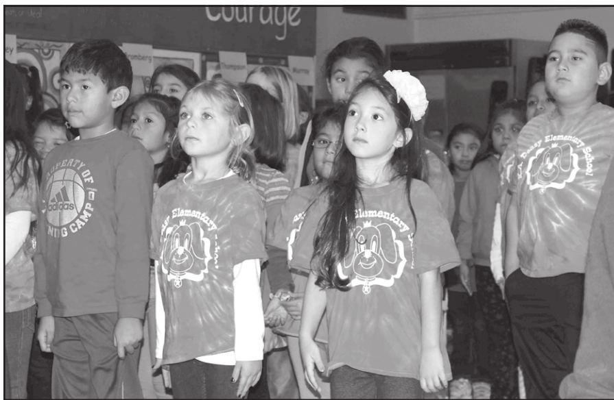
Students practiced standing up straight and being brave at the assembly.

The “Sticks & Stones” assembly was brought to the school as part of its Red Ribbon Week celebration.