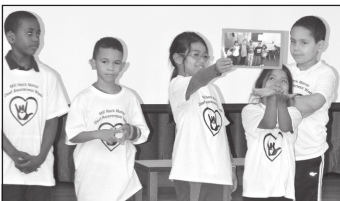
One elementary class shows the picture they’ll be placing in the Mill Neck time capsule.