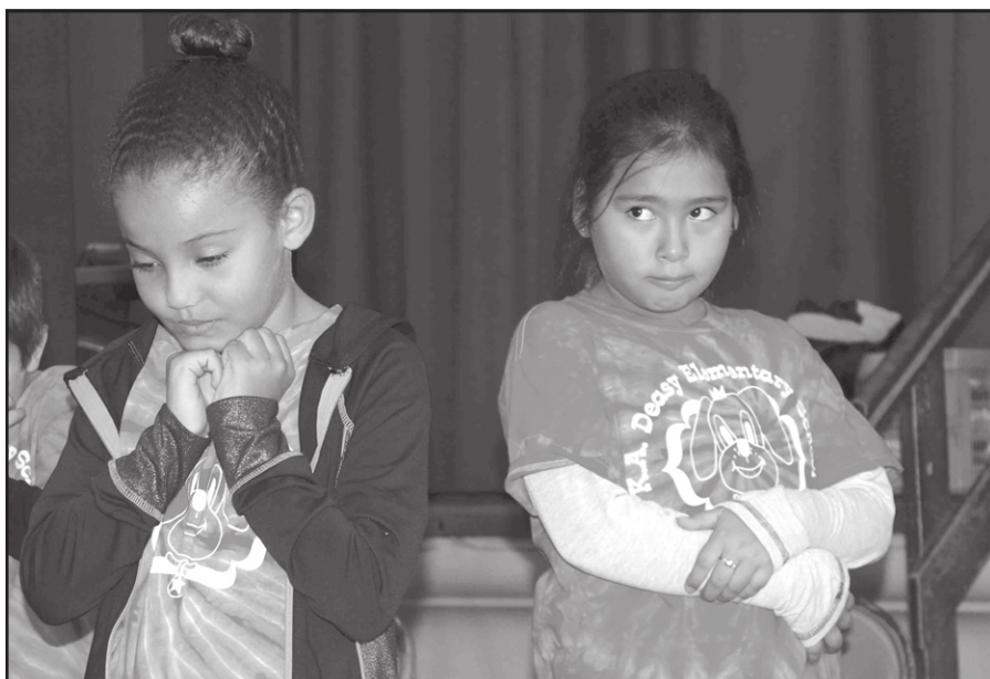
Students showed how they’d feel if they were being bullied.