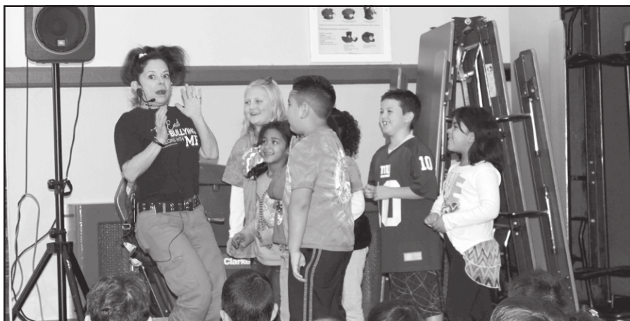
Deasy students stood up for their friend, who was being “bullied” as part of a skit.