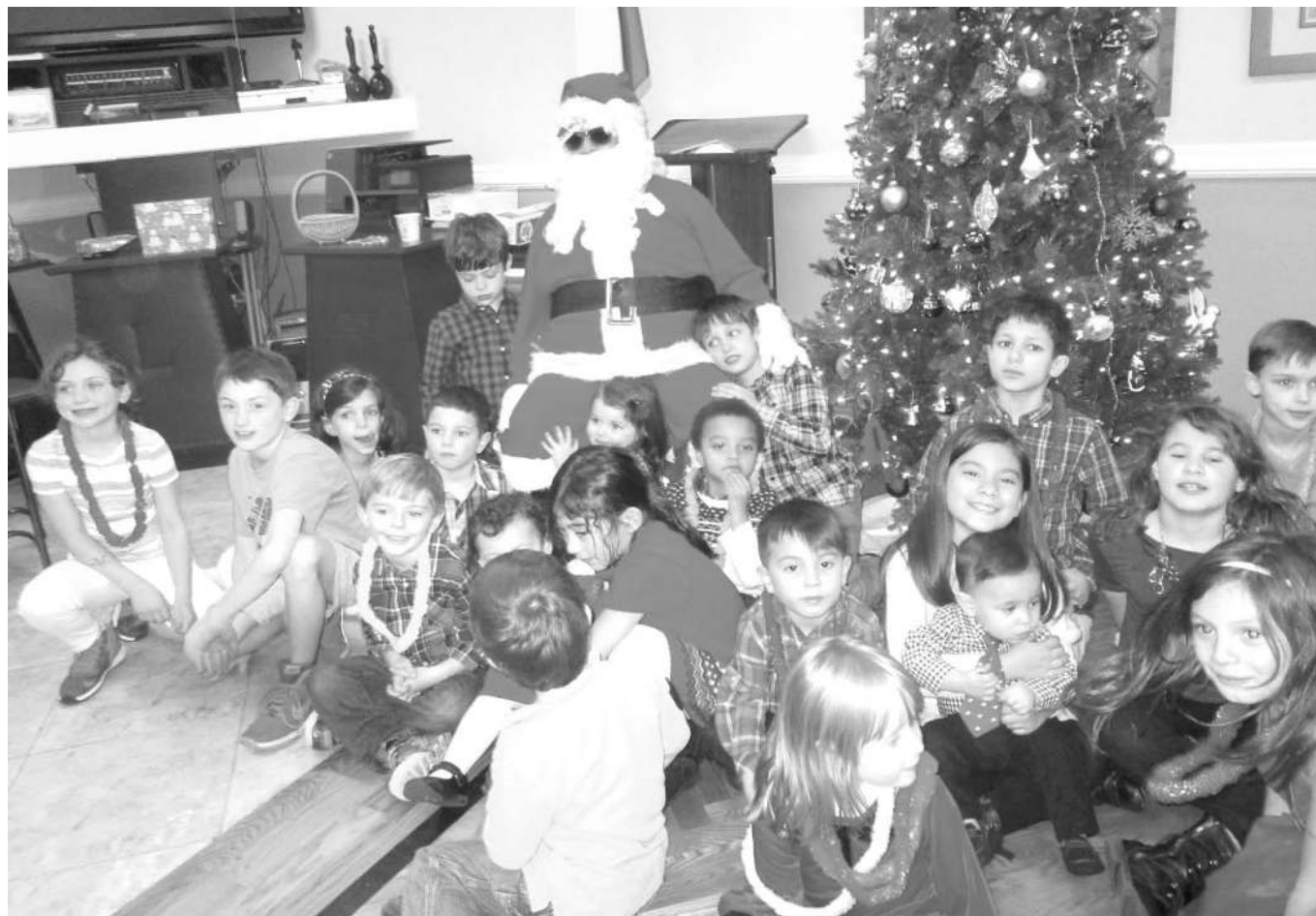
Photo: Children and Santa

For Gazette advertising information call 671-2360