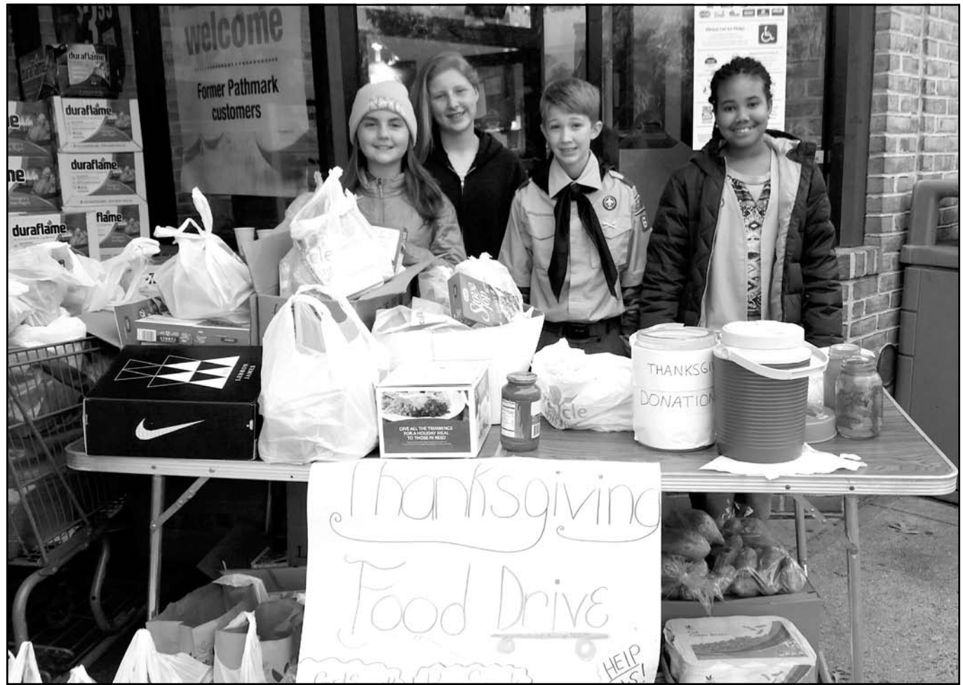
Boy Scouts from Troop 6, former Girl Scouts from Troop 125 and members of the Glen Cove High School Interact Club conducted food drives outside of Stop and Shop and Holiday Farms. The students' efforts resulted in three minivans full of donations.

Thanks to the generosity of many, the November and December holidays were truly a time to give thanks, both for a delicious meal and for the people and groups that made it possible.