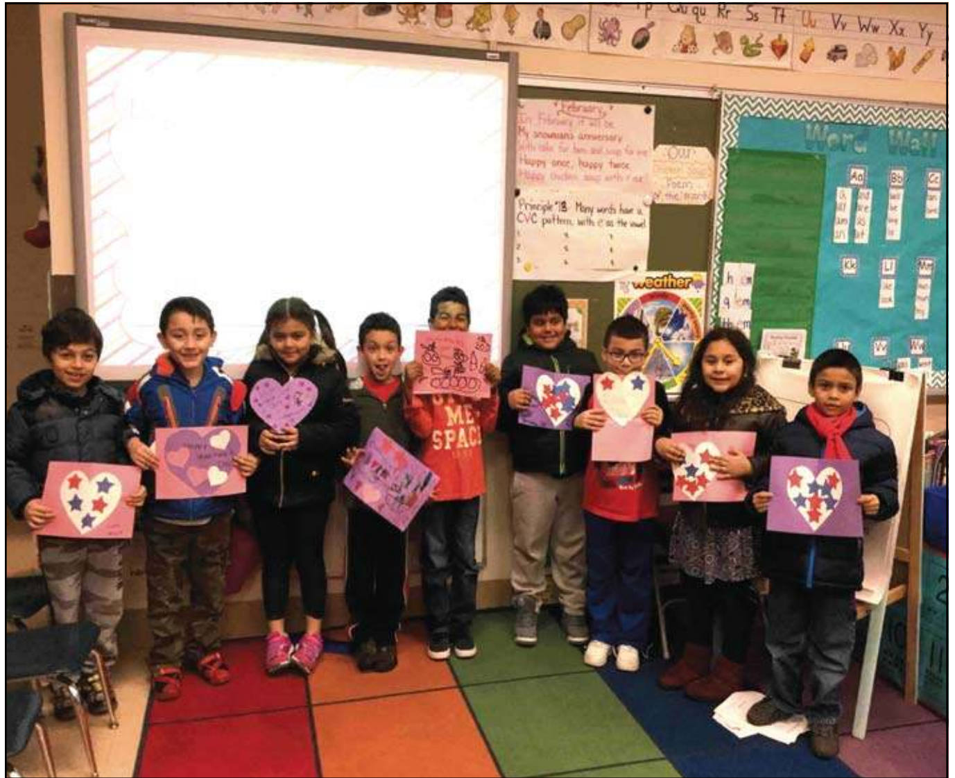
Photo Caption: Deasy students having been performing random acts of kindness throughout the month of February.

The children took time to make cards for their classmates, each with a special compliment inside, and also created valentines for their parents. At the end of February, the students will earn a certificate stating that they have been a "kind kid" for the month and should be recognized. The students have been motivated by this concept and their teachers hope that the acts of kindness carry over into the children's home lives and situations outside of school.