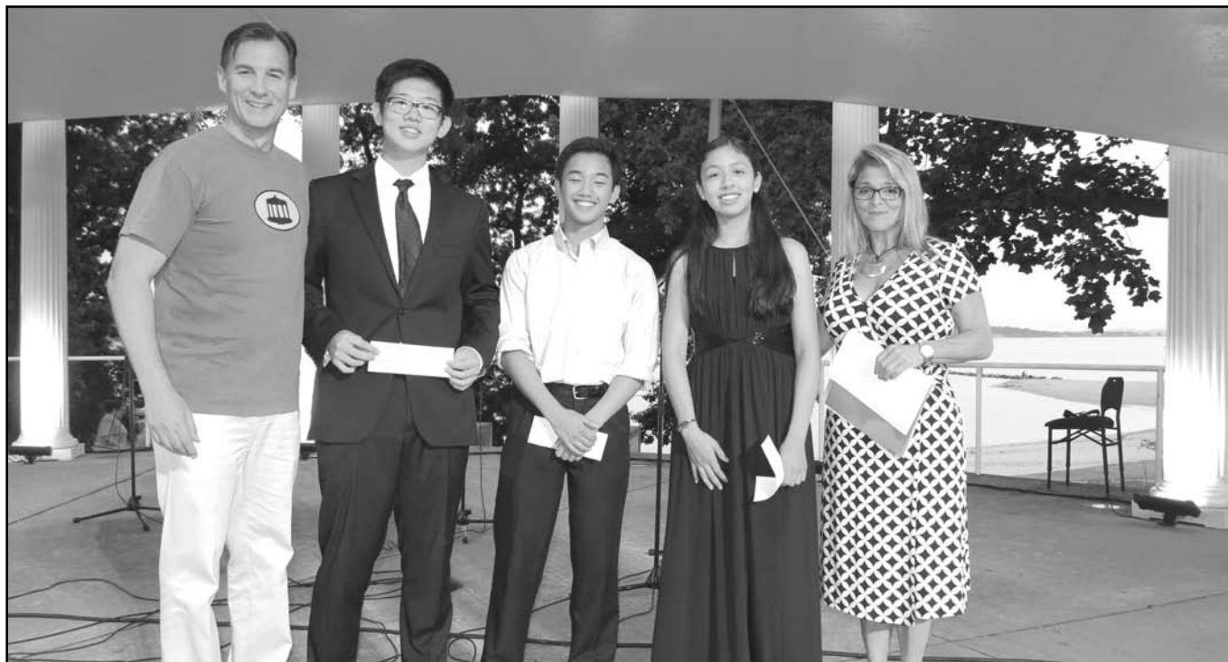
PHOTO CAPTION: Applications are now due for the 44th Annual Morgan Park Summer Music Festival Young Performers Talent Competition. All budding musicians between the ages of 10 and 19, who live or go to school on Nassau County's North Shore are invited to participate in this year's competition. Three cash prizes will be awarded to the winners. Applications are due by Thursday, March 17 and may be downloaded at http://www.morganparkmusic.org.