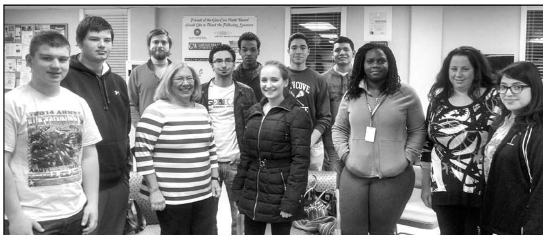
The Glen Cove Youth Bureau's

Interested Teens ages 16-18 Encouraged to Attend March 2nd Informational Meeting