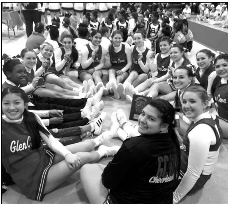
Photo Caption: Glen Cove High School's Cheerleading team was named runners-up at the Nassau County Championship at Wantagh High School.

Glen Cove will be competing at the national level at the Cheer and Dance Extreme Grand National Championship in Virginia Beach on March 12. Good luck, Glen Cove!