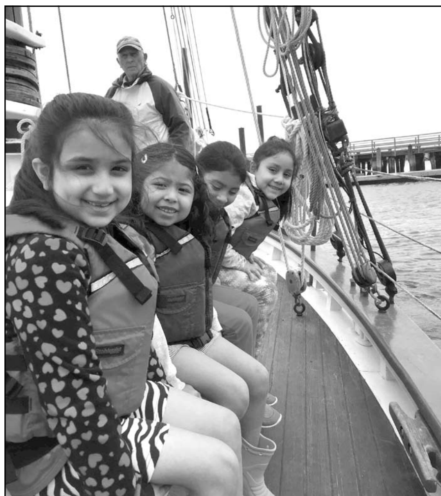
Photo Caption: Deasy School first-graders had an opportunity to sail on the 125-year old sailboat Christeen during a field trip to the Oyster Bay WaterFront Center.

While there, students set sail on the Christeen, a 125-year old sailboat. The students learned about the history of the boat and were even put to work, helping to pull the lines to lift the sails. They also had the chance to experience marine life up close during a walk along the beach, and enjoyed observing and collecting seashells and sea creatures.