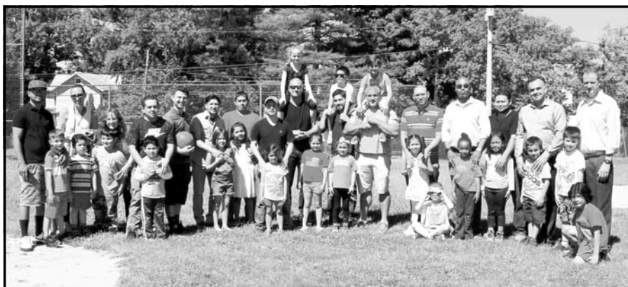
First-graders played kickball with their dads during the school's annual Father's Day celebration.