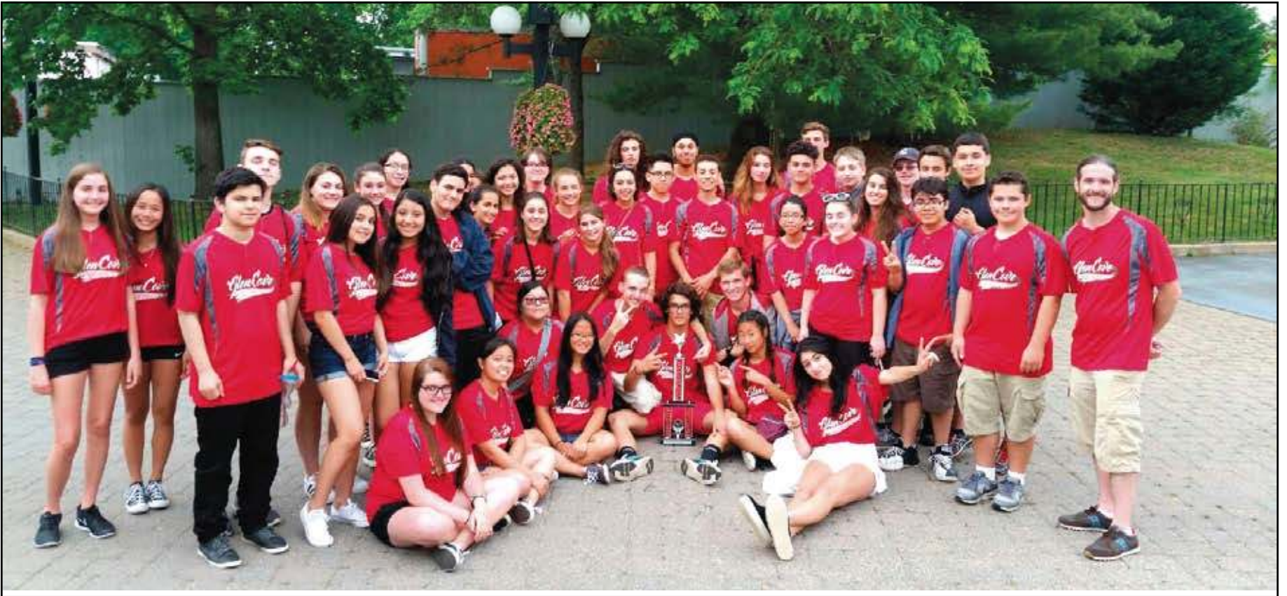
Glen Cove High School's wind ensemble placed first in their division at the Music in the Parks competition in New Jersey.