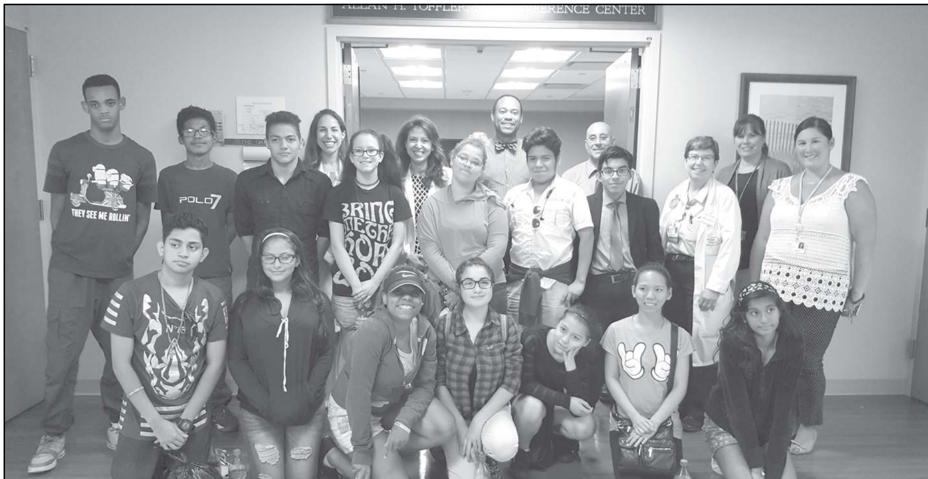
Recently, Glen Cove Hospital had more than a dozen students from the Mill Neck Manor School for the Deaf tour the hospital and experience a panel discussion about various healthcare careers. Pictured are the Mill Neck Manor School for the Deaf students with the panelists from Glen Cove Hospital.