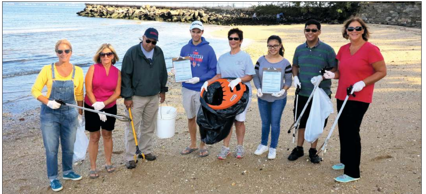
By Tab Hauser

The Glen Cove Beautification Commission sponsored a beach clean-up day held at Prybil and Crescent Beach. Volunteering for the event were approximately 60 area residents