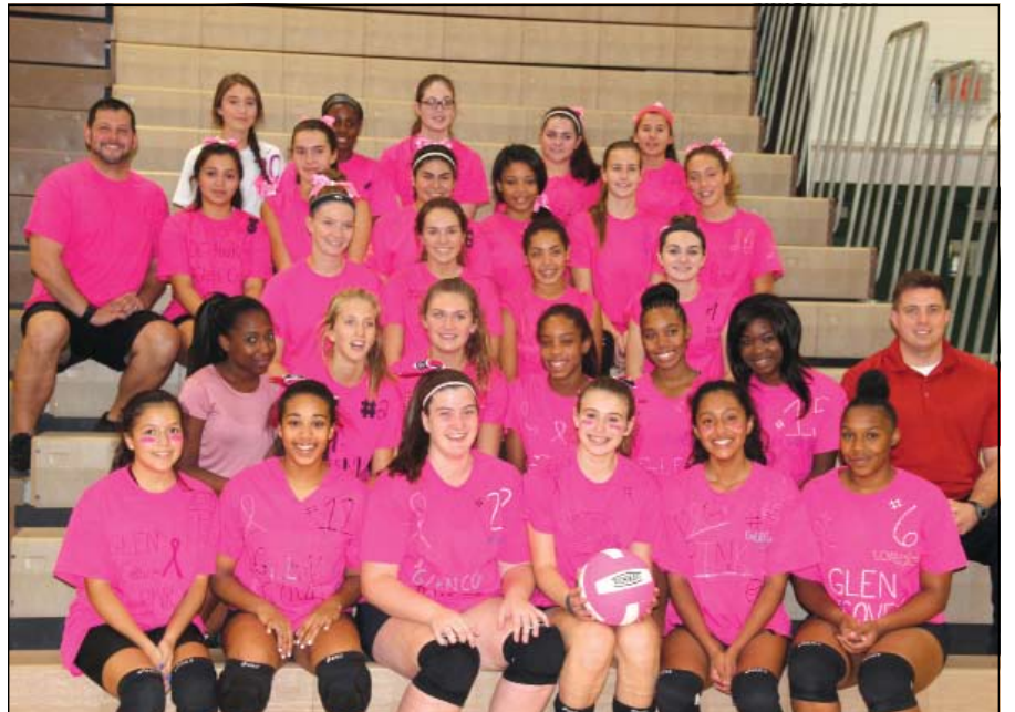
Photo Caption: Glen Cove High School's girls volleyball team and Locust Valley High School's volleyball programs teamed up for a Dig Pink non-league game.