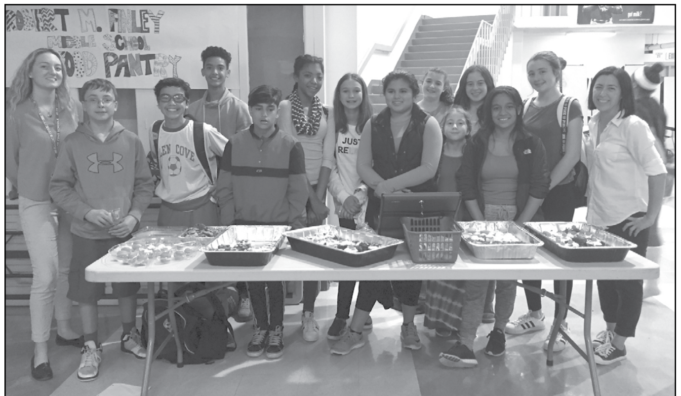
Photo Caption: Members of Finley Middle School's National Junior Honor Society and student council held many events to raise awareness to Breast Cancer during the month of October.

On Oct. 16, the students attended the Making Strides Against Breast Cancer walk at Jones Beach, in addition to holding bake sales and selling pink bracelets throughout the month. The Finley staff also contributed to the cause through a "wear pink" fundraising day. In all, the students donated $750 to the American Cancer Society.