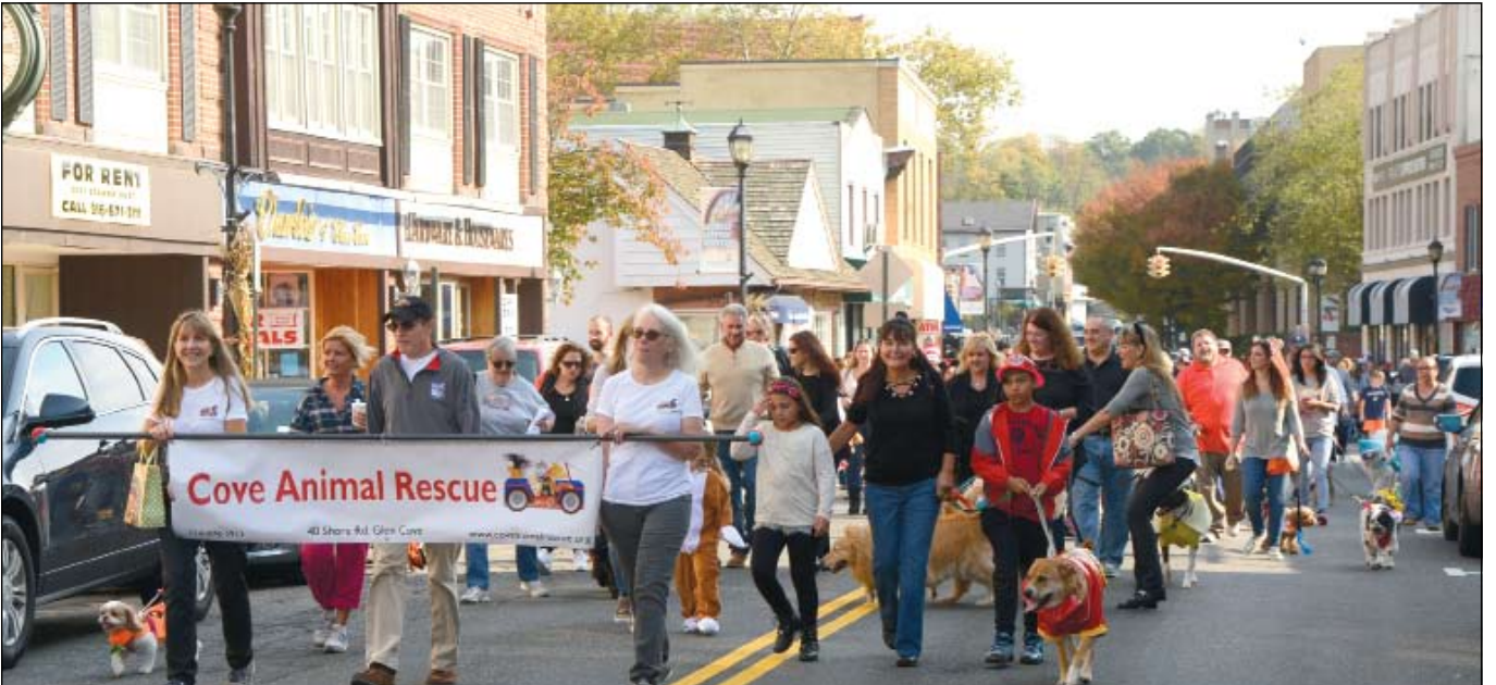
Howl'oween Pet Parade participants march down Glen Street