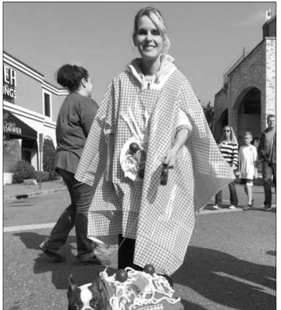
A delicious take on a Halloween costume showed a clever portrayal of spaghetti and meatballs

For Gazette advertising information call 671-2360