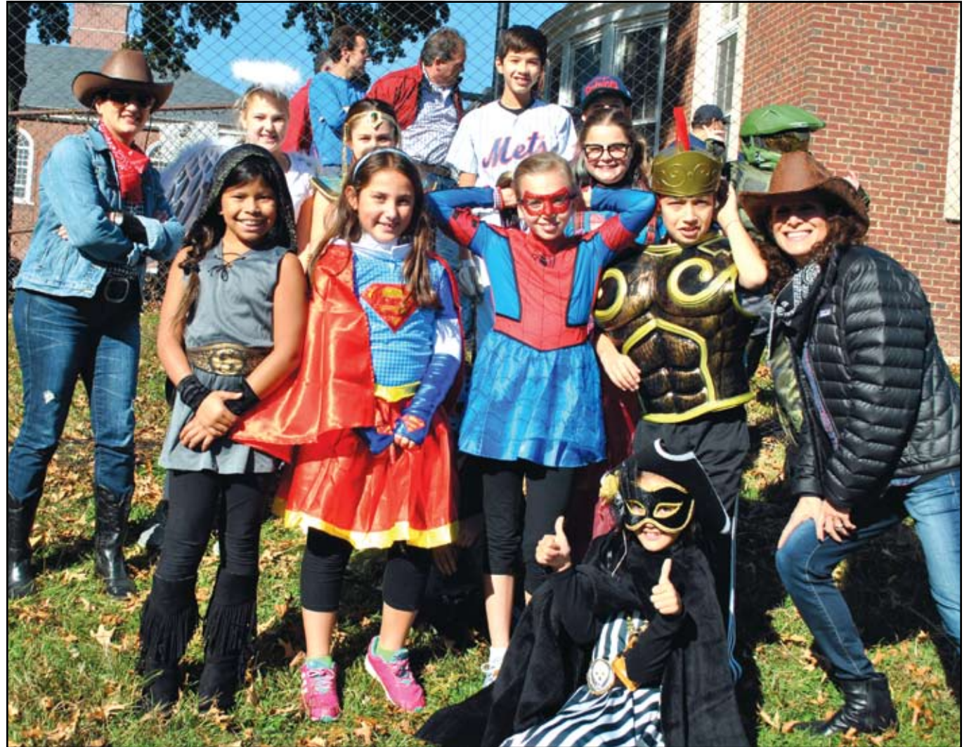
Photo Caption: Article and photos by Shelly Newman Everyone had a ghoulish time dressed in elaborate Halloween costumes at both the Sea Cliff and Glenwood Landing Schools as children and faculty participated in the annual Halloween parades!

At Glenwood Landing School, many parents and family members gathered on the field to watch each class of students come out all dressed in their fantastic Halloween costumes. It was a frightful but memorable day at both North Shore Elementary Schools! Happy Halloween to all!!!