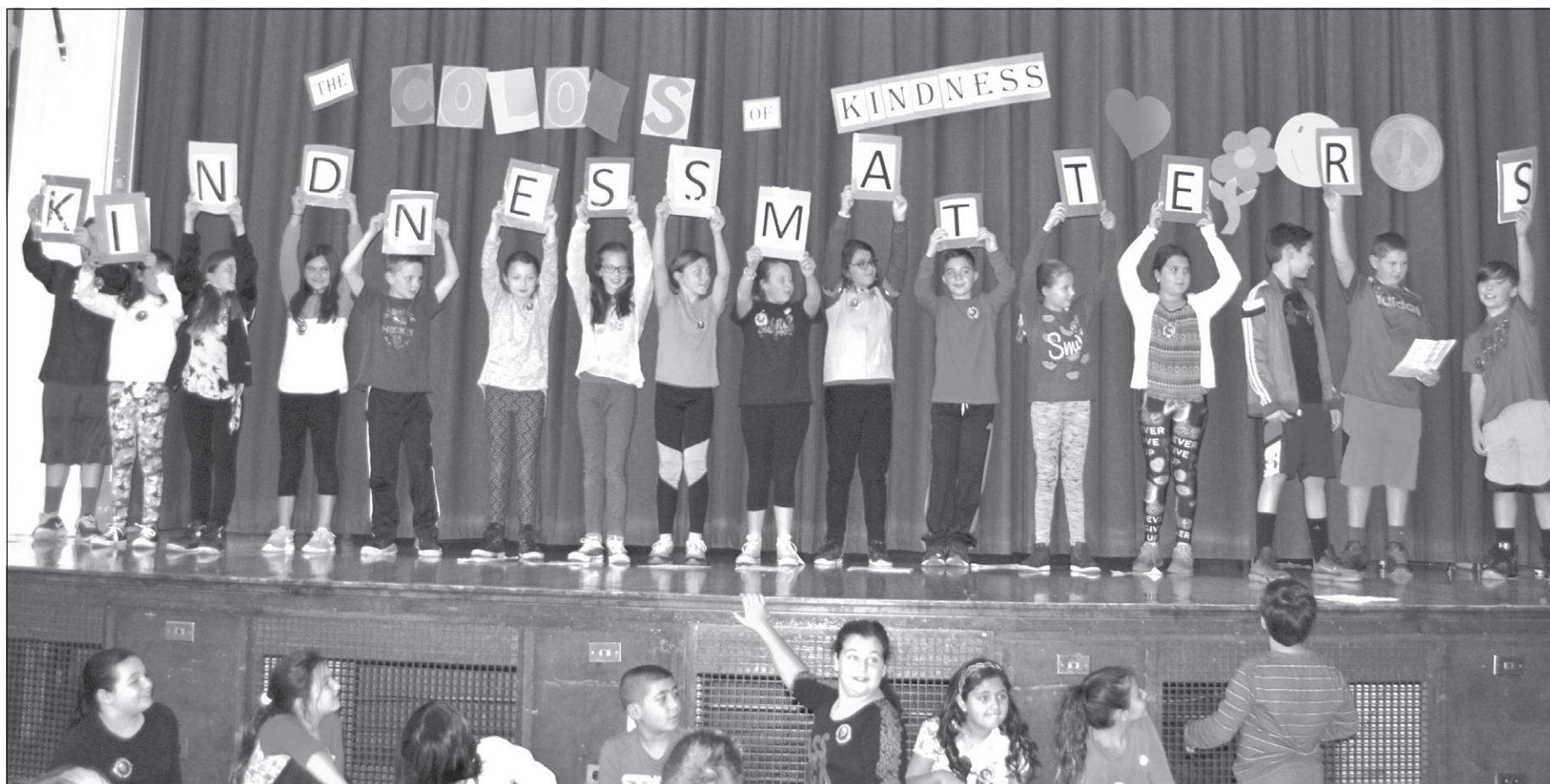
"Kindness Matters" was reiterated by students at Glen Head School in the Dignity for All Club as they encouraged their peers to participate in the Great Kindness Challenge.

To kick-off The Great Kindness Challenge (GKC), the Glen Head School Dignity For All Club took to the stage in the Gathering Room and held a pep rally for all of the students and faculty. On stage, the students emphasized the theme, "kindness matters," by prominently holding up the individual letters for everyone to see!