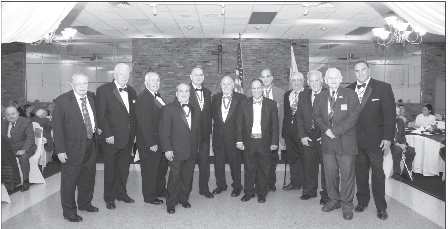
The Knights of Columbus James Norton Council 1828 recently held a Dinner Gala to celebrate 100 years of service to the community. Pictured are all the Past Grand Knights who attended the festivities.