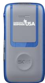
GPS Mobile Unit