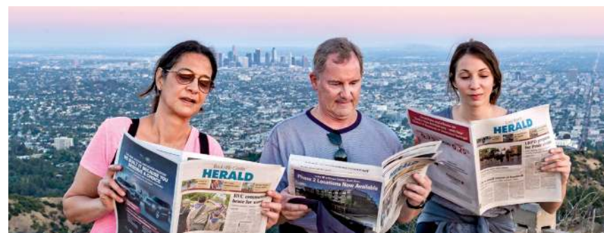
Remembering a much-loved husband, father and friend — Mount Hollywood, Los Angeles

bor is full of swimmers, recreational boaters, kayakers, and paddle boarders. Additionally, there are 75-100 children (as young as 8 years old) who are enrolled in the two local sailing camps in these waters. With such short notice, it is virtually impossible to develop a safety plan that would assure that all these people wouldn't be having their lives put in peril by such an impulsive action as launching a ferry service immediately.