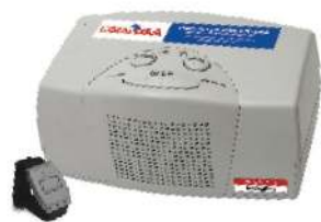
Landline Home-based Unit